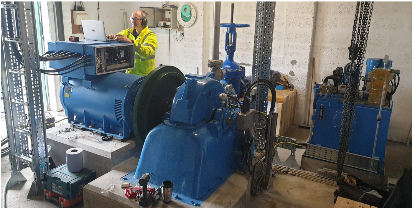
Commissioning of refurbished turbine